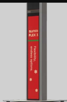
Customizable Floor-Standing Light Box