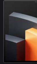
FLEX 3 22"