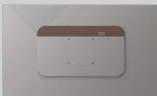
Customizable Decorative Strip

Personalized customization to meet the diverse brand needs.