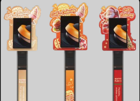
Customizable KT Board