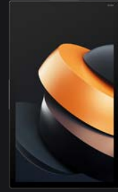
FLEX 3 27"