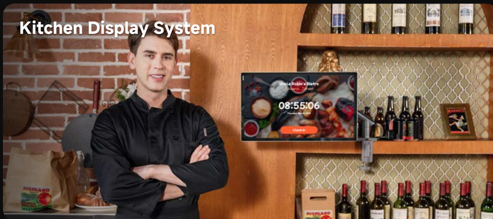
Kitchen Display System