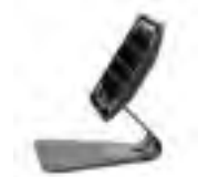
AC-112 Adjustable Stand 30°/45°/60°