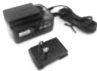
Adapter DC 12V 1.5A