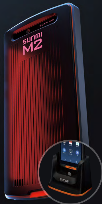
Optional single stand charger